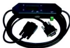
RS-232 + USB – MPI / PPI adapter, 12 MBaud