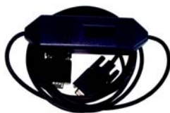
RS-232 – MPI / PPI adapter, 187,5 KBaud