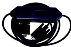
RS-232 – MPI / PPI adapter, 187,5 KBAud